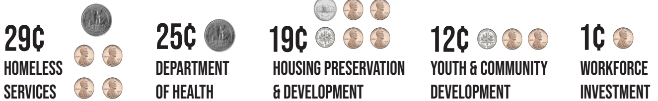
Adopted Budget Fiscal Year 2020, City of New York.